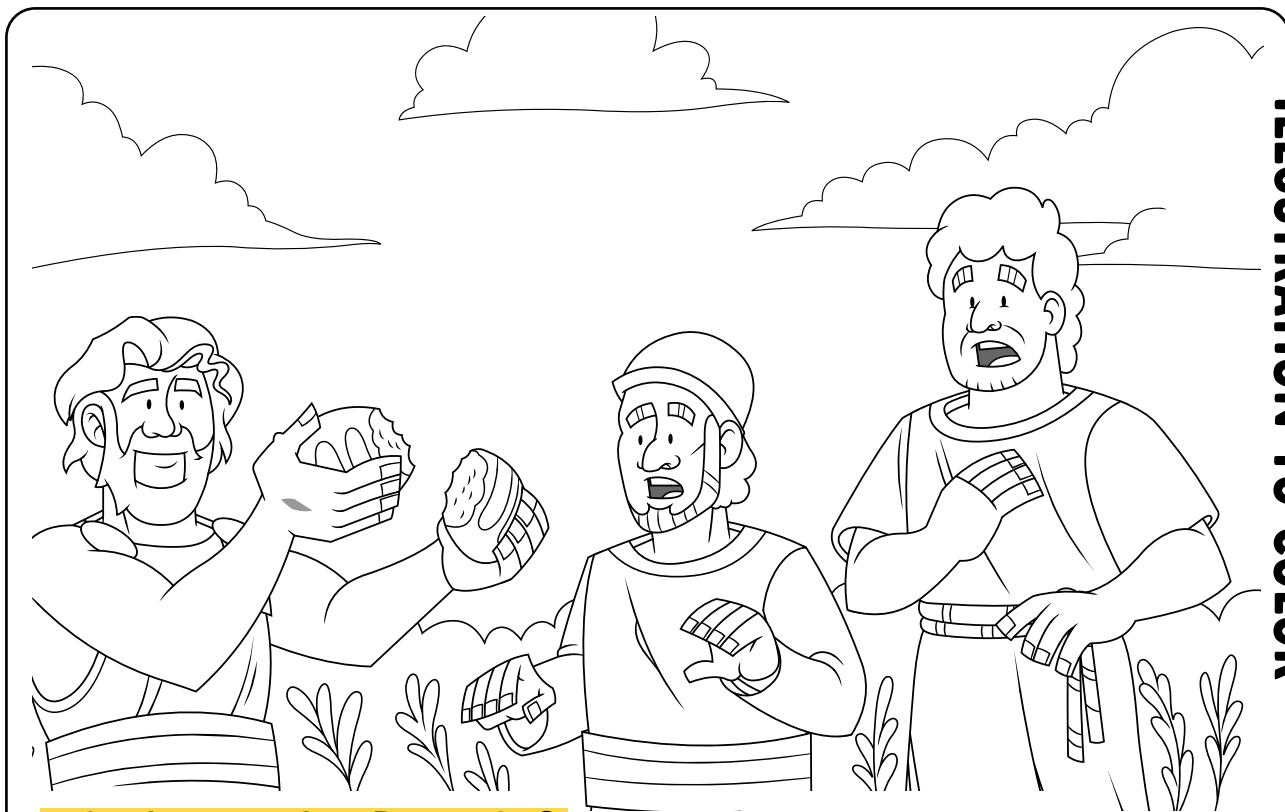
ILLUSTRATION TO COLOR